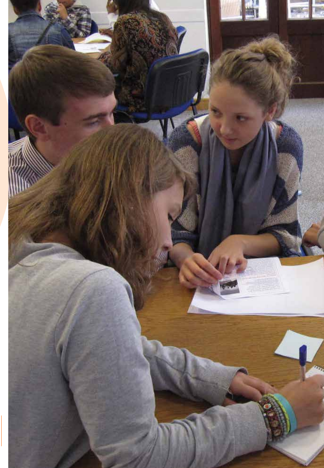
A key theme of our work is the active involvement of children and young people in research

We focus on generating research that is accessible to a diverse audience and we actively engage with children and young people as participants, as well as in the planning, delivery and dissemination of our research projects.